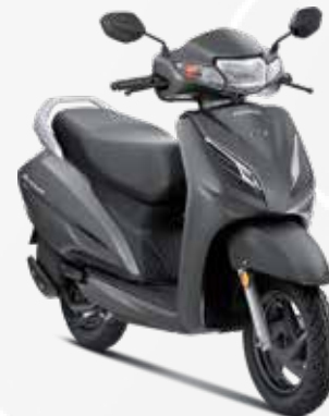
Mat Axis Gray Metallic