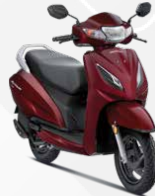
Rebel Red Metallic